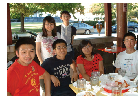
Students from Peking University