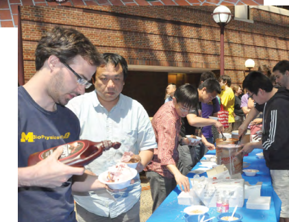
Ice cream social