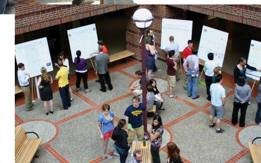
Vaughan poster session