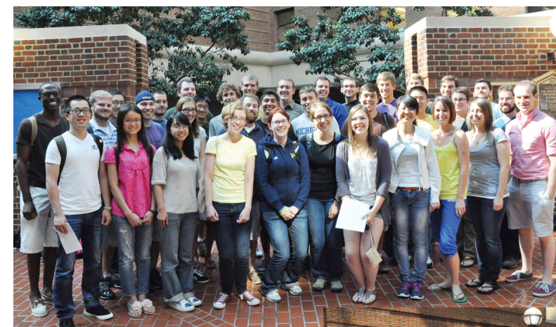
Incoming Graduate Class of 2012

Address corrections should be directed to UM Alumni Office website at http://alumni.umich.edu/ Personal updates can be sent to: University of Michigan, Chemistry Alumni Office, Department of Chemistry 930 N. University Ave., Ann Arbor, MI 48109-1055; E-mail: chem.alum@umich.edu Chemistry Web Address: http://www.umich.edu/~michchem