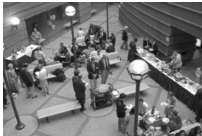
2004 Awards Lunch