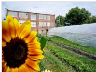
Earth Works Community Farm, Detroit.

By giving our children and young people a better reason to learn than just the individualistic one of getting a job or making more money, by encouraging them to make a difference in their neighborhoods, we would get their cognitive juices flowing.