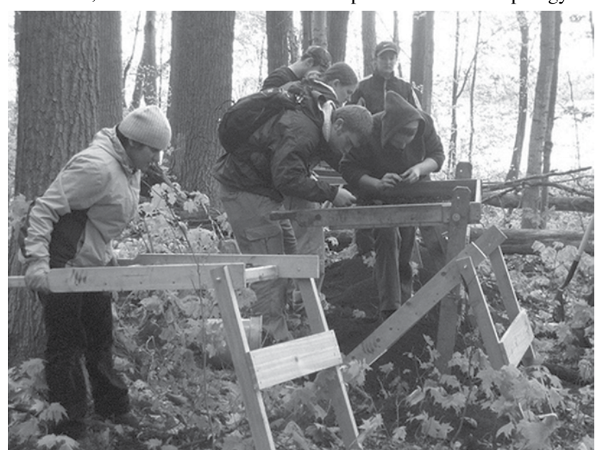
Excavation at the Michigan Biological Field School.

In 2006, Museum researchers sponsored three archaeological field schools, offered in concert with the Department of Anthropology.