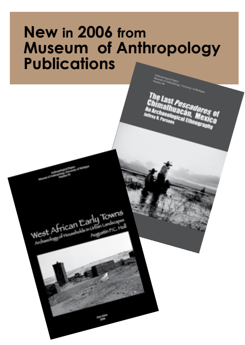
West African Early Towns: Archaeology of Households in Urban Landscapes (Anthro. Papers, 95) by Augustin F.C. Holl

Tineke Van Zandt: Shaping Stones and Shaping Pueblos: Architecture, Site Layout and Settlement in Bandelier National Monument, New Mexico, December 2005.