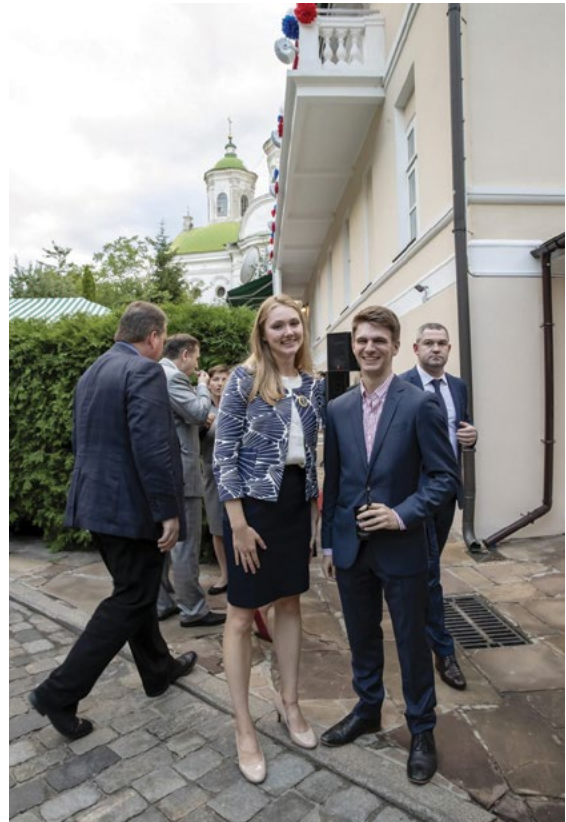
Above Photo Press team interns working Ambassador's July 4 reception