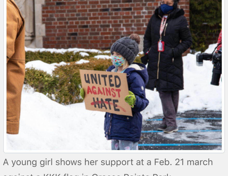
A young girl shows her support at a Feb. 21 march against a KKK flag in Grosse Pointe Park.