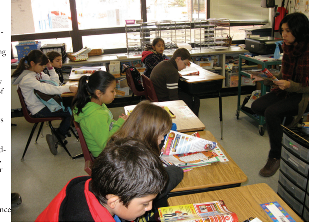
Students in the En Nuestra Lengua program.

"The "achievement gap" in education refers to the disparity in academic performance between groups of students. The achievement gap shows up in grades, standardizedtest scores, course selection, dropout rates, and college-completion rates, among other success measures. It is most often used to describe the troubling performance gaps between African-American and Hispanic students, at the lower end of the performance scale, and their non-Hispanic white peers, and the similar academic disparity between students from low-income families and those who are better off." (2011 Education Week)