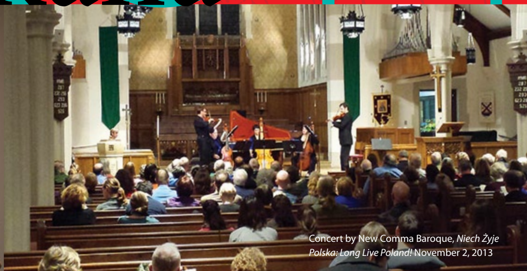
Concert by New Comma Baroque, Niech Żyje Polska: Long Live Poland! November 2, 2013