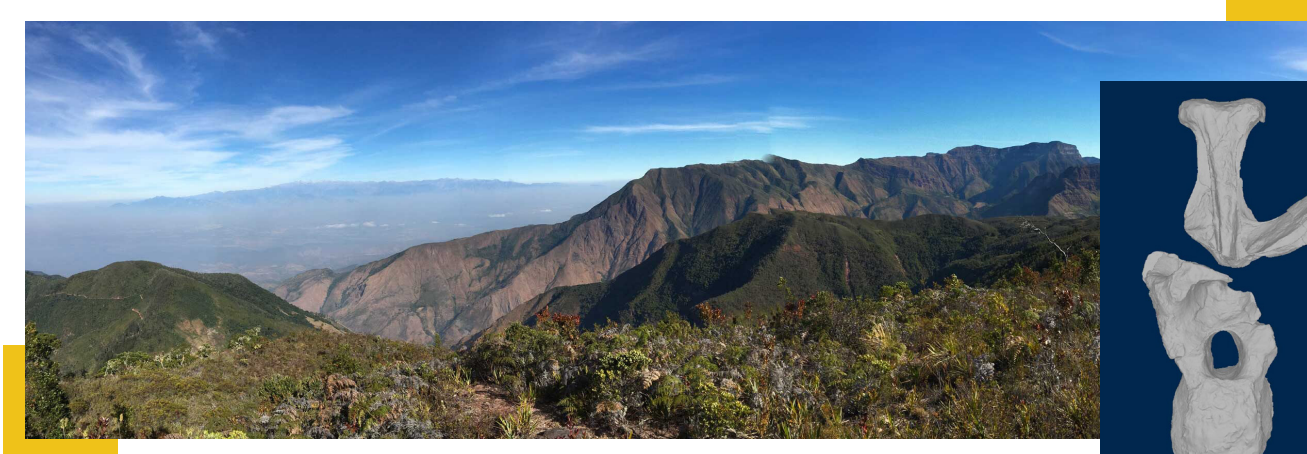
Panoramic view of the Serranía del Perijá in Colombia, where the vertebra was found in 1943.

In addition, The University of Michigan Online Repository of Fossils hosts a 3D model of the specimen which was used for further study and analysis. The full article published by the University of Michigan Press Office can be found here .