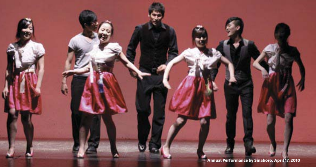
Annual Performance by Sinaboro, April 17, 2010