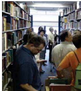
The Korean Studies collection has increased in size by 215% since 2003.

The Korean Studies collection has received generous funding support from the library administration despite the financial crisis in Michigan and the U.S.