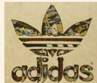
Son's Munjado series includes the depictions of the logos of the two athletic shoe giants Nike and Adidas.

Much venerated as an artistic tradition, ink painting accounts for a sizable proportion of artistic production in East and Southeast Asia. Yet few critics, curators, and institutions actively regard it as contemporary art, a telling reminder of the extent to which the contemporary art field remains beholden to certain definitions of the new and noteworthy.