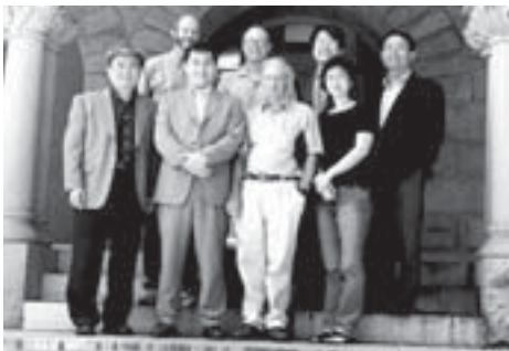
June 7, 2003 meeting of ASCK steering committee at Stanford University

ASCK believes that current problems on the Korean peninsula and between US and the two Koreas can only be solved through dialogue, cooperation, and the active pursuit of peace. ASCK feels the responsibility to speak out against policies that increase tensions in Northeast Asia and may lead to another catastrophic war in Korea. ASCK wishes to add its voice to a constructive discussion on how to achieve a peaceful, unified Korea existing in harmony with its neighbors, including the United States. To learn more about ASCK, go to www.asck.org .