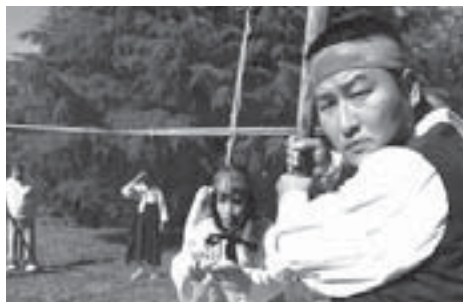
YMCA Baseball Team

Set between 1905 and 1906, when Chosŏn-era Korea was undergoing a transition with the arrival of Western modernity as well as Japanese imperial forces, this popular sports comedy offers a rare, ethnographic look at turn-of-century Hwangŏng (Seoul). Assisted by a "New Woman" named Min Chŏng-rim, American missionaries teach Koreans how to play baseball, in the process turning a ragtag group of men from different social affiliations (scholars, offspring of the ruling-class, peasants, peddlers) into a unified team called YMCA—the first in Korean history. By the end, our unlikely heroes emerge as a symbol of hope for Korea, even as the nation was facing Japanese annexation.