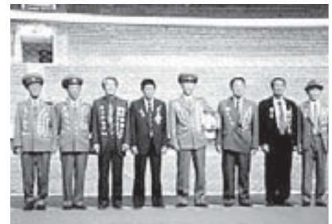
The eight surviving members of the 1966 North Korean Football Team

struggle, success, surprise and football transcending political and cultural boundaries.