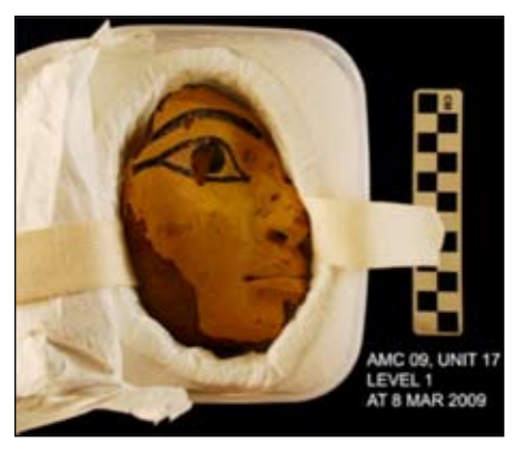
Fig. 2. Painted wood coffin fragment, after treatment (left) and packed in a custom-fitted container (right).

gate artifact condition and to recommend storage improvements for artifacts that are stored at the dig house. The survey, designed and built by the author