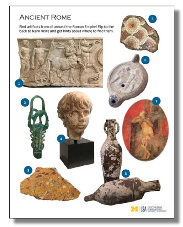
A page from the Ancient Rome scavenger hunt, which can be downloaded from the Kelsey's Self-Guided Tours page.

Docent training isn't the only thing to go digital this summer. The Education Department has also been developing remote learning resources for university and K-12 classrooms. These include activity worksheets and PowerPoint tours over Zoom. We will roll out more activities this fall, so keep an eye on the Education webpage for more information and resources to come. Don't forget to also check out Kelsey@Home, which has digital resources for visitors of all ages. We just added some fun new self-guided tours for you to follow when we reopen to the public. Download these to your phone or tablet, or print them out and bring them with you to the museum on your next visit.