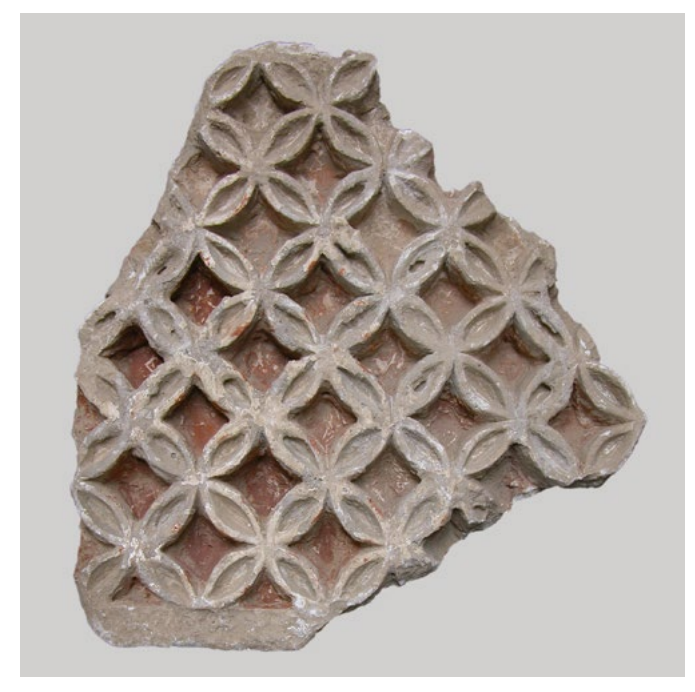
Figure 1. Painted stucco architectural fragment from Seleucia-on-the-Tigris, 1st-3rd centuries CE. 34.5 \times 32 \times 6.5 cm. KM 32330.

The Antonine Plague swept through the Roman Empire in the late second century CE. Its name comes from the Antoninus family, several of whose members were emperors during this period. Likely to have been smallpox, the Antonine Plague first appeared in 165 CE and lasted for at least 15 years. The Roman military carried the plague across the Mediterranean and beyond, where it periodically resurfaced and devastated local populations. The