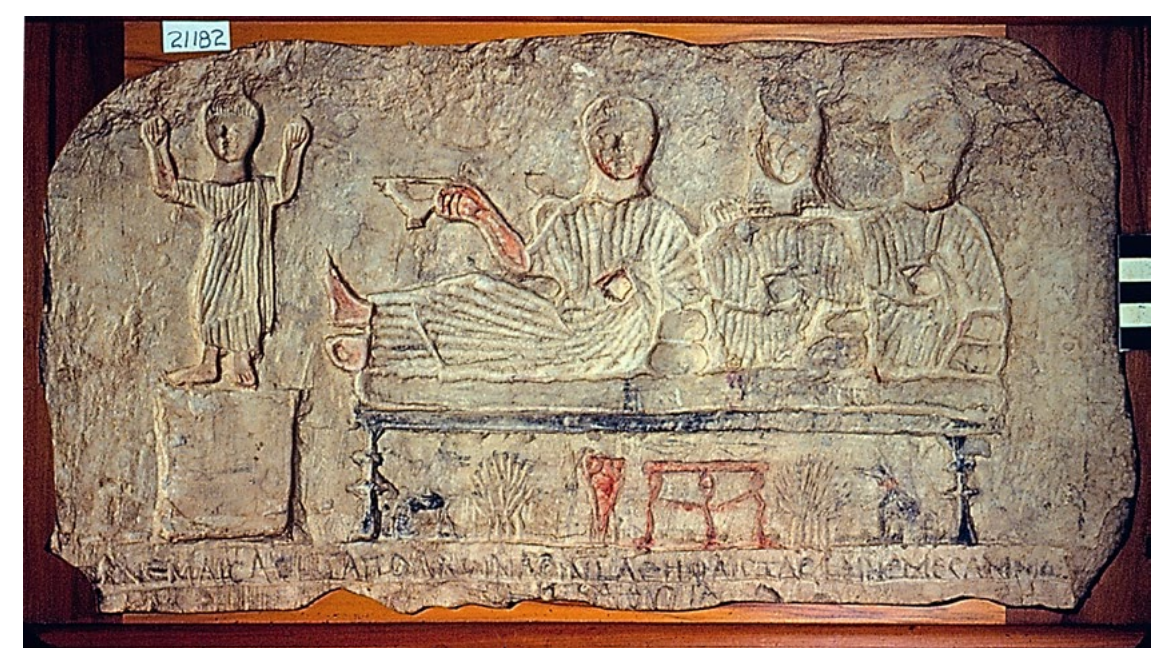
Figure 4. Painted limestone funerary stela for four people from Terenouthis, dated Athyr 11, Year 20 (probably November 8, 179 CE): Nemesion, age 60, Apollonarion, age 35, Hephaistas, age 40, Nemesammon, age unknown. KM 21182.

convention has been to see this date as that of a big disaster or collective death, it seems more likely to be a date chosen for a mass-commemoration of many recently deceased individuals. Although the Antonine Plague must have been devastating to Terenouthis, in fact, the town continued on, and burials from the third and fourth centuries CE show an unexpected level of prosperity.