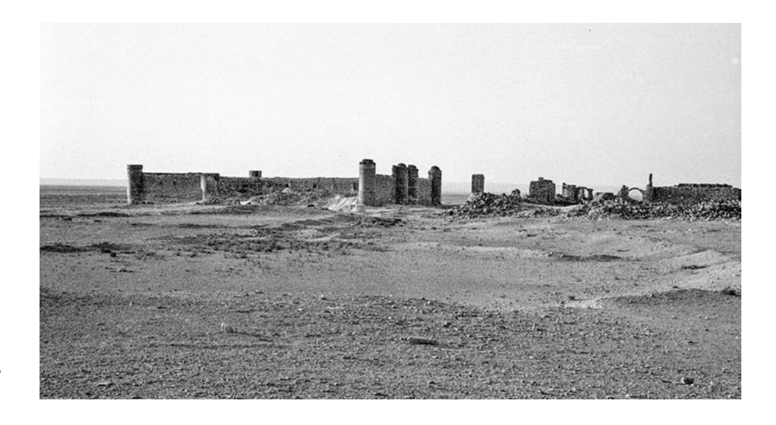
Qasr al-Hayr, view of the Small Enclosure at the left and the Large Enclosure at the right.

Individual components of this proposal are scalable, so they can be used in a larger exhibition or in one or more smaller cases, or even in online presentation. Vivien also proposed ways to reach out to those various audiences, a crucial element of this work. Vivien's proposal is a way for the Kelsey to think about how we can make our collections accessible, make the museum more inclusive, and continue to celebrate the diversity in our audiences and collections.