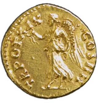
Figure 2. Obverse and reverse of a gold coin of Antoninus Pius from 155/6 CE, found in a coin hoard at Karanis. KM 40987.

period, with losses unevenly distributed. Although these statistical records do not include any personal accounts, the devastation caused by so many deaths must have seemed overwhelming to the survivors. In general, the population of Egypt recovered after the plague, but these great losses had lasting consequences.