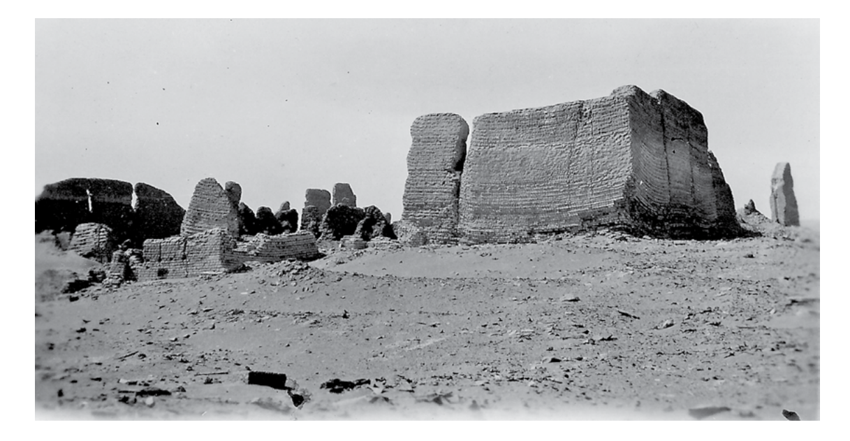
Figure 3. Ruins of the temple enclosure at Soknopaiou Nesos, photographed by Easton Kelsey in April 1920. Kelsey archival photograph KK156.

We can see graphic representation of the toll taken by the Antonine Plague in another Egyptian site excavated by Michigan, the cemetery of Terenouthis (modern Kom Abou Billou). Michigan excavators spent a month at Terenouthis in 1935, a preliminary investigation for a longer-term project that never happened. In spite of its brevity, the season yielded a wealth of funerary material from three separate phases: Ptolemaic/early Roman (2nd c. BCE-Ist c. CE), Late Roman (late 3rd-4th c. CE), and the later second century CE, the time of the Antonine Plague. From this period, the excavators found over 200 mudbrick cenotaphs, many with painted plaster decoration and most with funerary stelae recording the names, ages, and dates of the deceased (fig. 4). Under ordinary circumstances, these records of death would be grim reminders of the high levels of infant and child mortality known throughout Roman Egypt. But the Terenouthis funerary stelae made for multiple individuals attest to mass deaths of a sort uncommon in earlier (and later) times, with several members of a family dying or being buried on the same day. A number of stelae are dated to a single day (Athyr II = November 8) of a year 20 that many scholars have taken as the year 179 ce. Although the