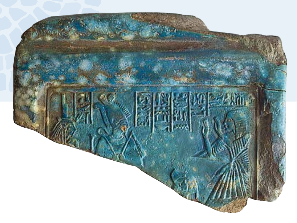
The stela of Ptahmose. Stone covered in blue faience glaze. Egypt, reign of Ramesses II, ca. 1250 BC.