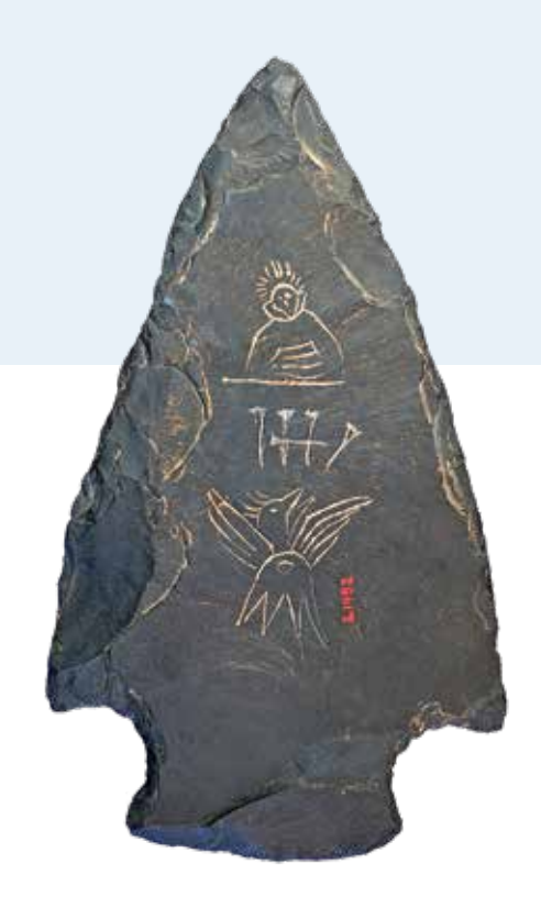
Slate "arrowhead" inscribed with images and a cuneiform sign. AD 1890–1898, Michigan, United States. UMMAA 21492.

The artifacts from this controversy exhibited in Excavating Archaeology are part of a group brought to Ann Arbor in 1898 in an unsuccessful attempt to sell them to the University. They are mostly