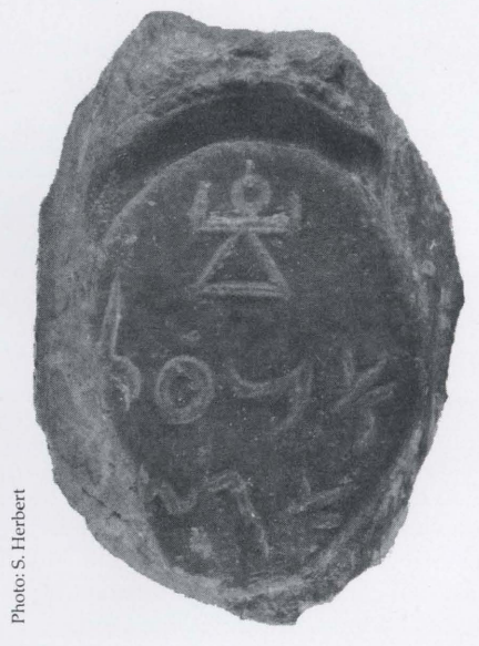
Bulla showing symbol of Tanit, a Phoenician fertility deity.

The cache of bullae found at Kedesh brings to thirteen the number of such Hellenistic archives found in the ancient world—from Carthage in the west to Seleucia-on-the-Tigris in the east. No