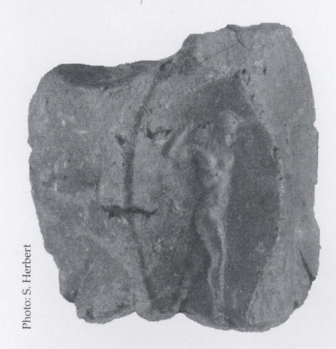
Bulla showing Aphrodite bathing.

and smashed on the floor, and the whole room was covered in a layer of lightly burned debris. The combination of destruction evidence and the chronological confirmation of the Greek amphora stamps secures our earlier hypothesis—that the site was hastily abandoned in the course of the battle of 145 B.C.E.