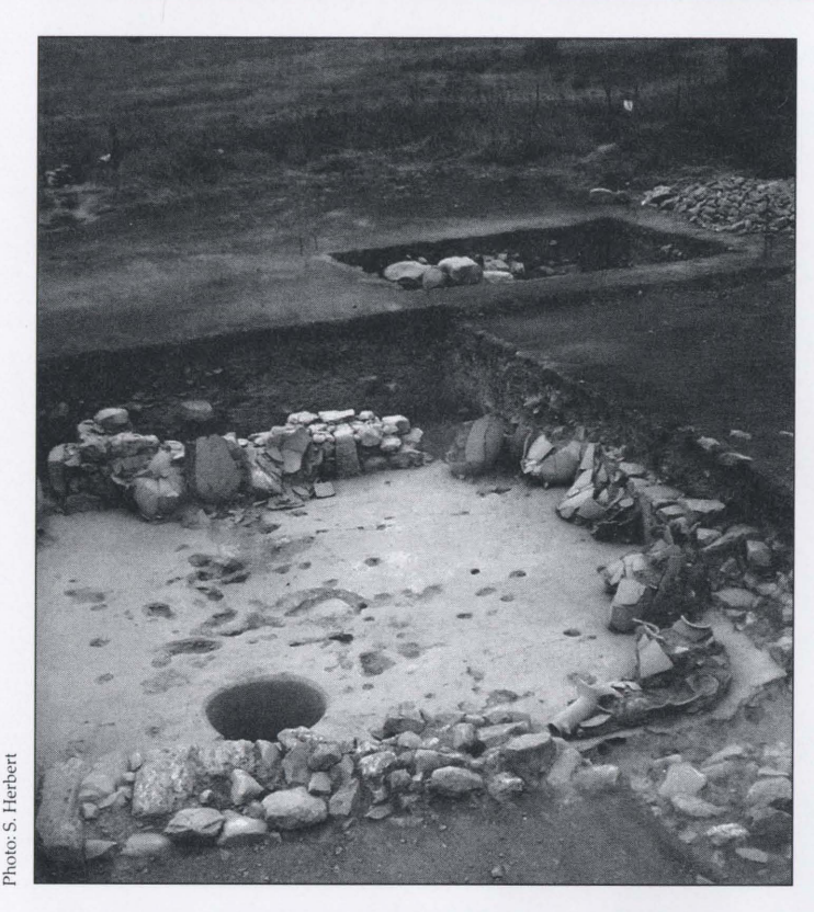
Site photo showing, in the foreground, the magazine containing large broken storage jars, or amphoras, which are visible around the walls of the room. In the background is the corner room where the bullae were found.

The team, consisting predominantly of students from both the University of Michigan and the University of Minnesota, was in the field from May 20 to July 18. We concentrated our efforts on the southern sector of the tel, where we opened large parts of five 10-by-10-meter excavation squares. We were also able to explore three other areas briefly.