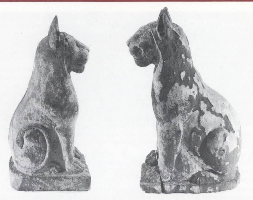
Wooden cat sarcophagus (left) and sculpture of a male cat (right) in the Ancient Near Eastern Gallery.

In Egyptian mythology cats, and male cats in particular, were originally associated with the sun god Ra. Vignettes of Ra, in cat form, decapitating the evil serpent