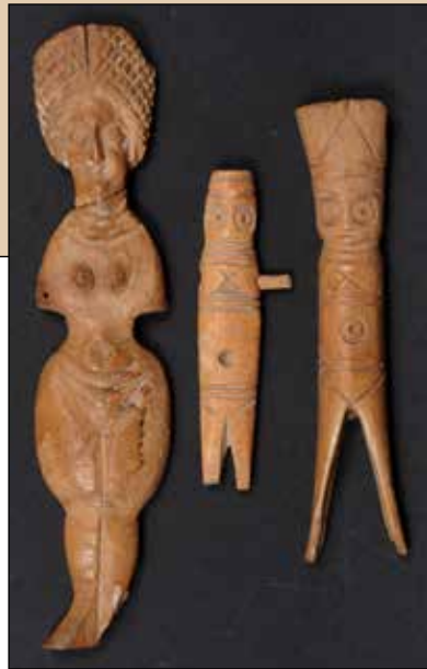
Right: Bone figurines (TMA 1931.479, KM 16198, KM 16180) excavated at Seleucia-on-the-Tigris.