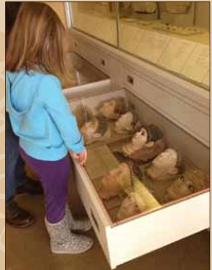
Another Family Day visitor pulls out a drawer in the Upjohn Wing to explore an array of mummy masks from Roman Egypt.