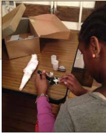
A participant in the Kelsey's February Family Day fashions a toy mummy using the materials she found in her shoebox mummy kit.