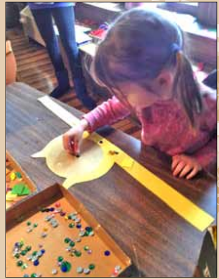
This young Family Day enthusiast begins to assemble a Hathor headdress out of colored paper and shiny beads.