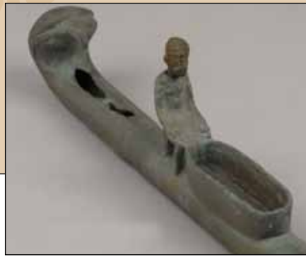
The censer before (far left) and after (left) treatment. KM 29764.