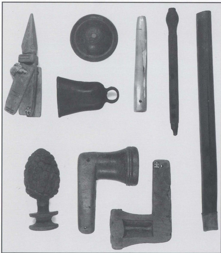
Roman-period (1st–4th centuries CE) musical instruments from University of Michigan excavations in Egypt. From Karanis, top left: wooden clapper (KM 7535) bronze cymbal (KM 21434), bronze bell (KM 10735); top right: bone whistle (KM 8504), wooden reed-flute (KM 26997), wooden reed-flute (3568); bottom left: pinecone-shaped wooden castanet half (KM 26358); From Dimai, bottom right: pair of L-shaped wooden castanets (KM 26360–1).