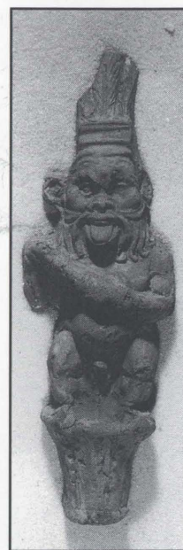
Mold-made terracotta figurine of the Egyptian god Bes playing a lute (1st–2nd century CE). KM 4960.