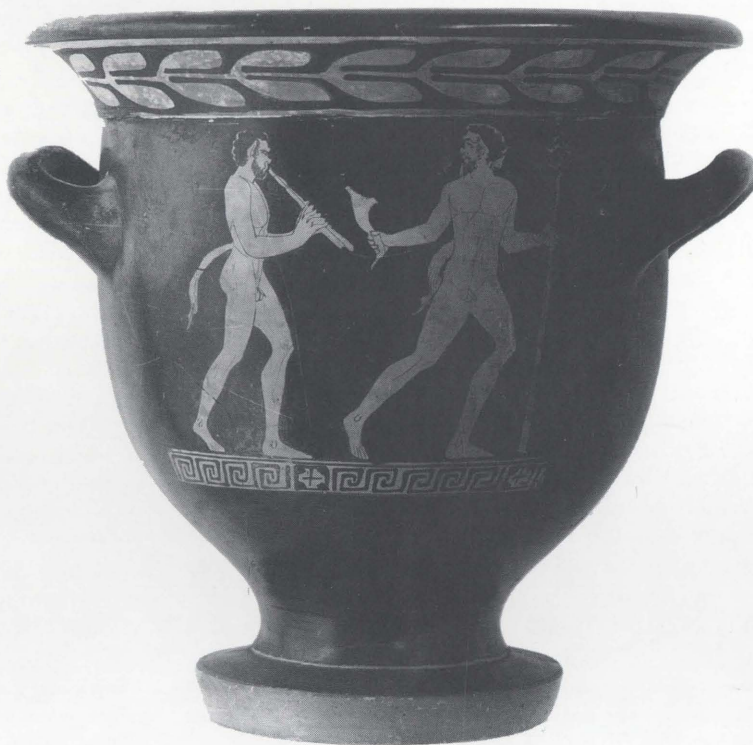
The painted decoration of this Roman bell krater (ca. 440–430 BCE) includes a depiction of a satyr playing a double-reed flute. KM 2610.

Although writers often wax poetic about the "birth" of music in prehistory, we have little direct evidence for how, where, or when music evolved. Musical instruments are known from the Mediterranean world as early as 10,000 BCE, but it is only after about 3000 BCE that substantial evidence for music becomes available. More instruments survive, as do more representations of them being played. Texts about music emerge, as well as early efforts to notate music. Cuneiform tablets from Mesopotamia contain treatises on music and musical instruments. One of the earliest pieces of musical notation to survive from the Mediterranean world is a Hurrian cult song from around 1400 BCE on a clay tablet from Ugarit. Specifics concerning instrumentation and pitch are speculative, as the widely varying attempts to reconstruct this song demonstrate. Cultures such as that