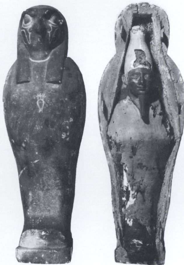
One of the most striking objects exhibited in "Death in Ancient Egypt" is this grain mummy of the god Osiris (right) in a wooden coffin with a falcon head (left), symbol of death and resurrection.

Various professional art, archaeological, and philological organizations will hold their annual meetings in the next few months. The Kelsey will be well