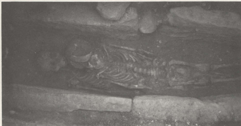
Carthage burial site.