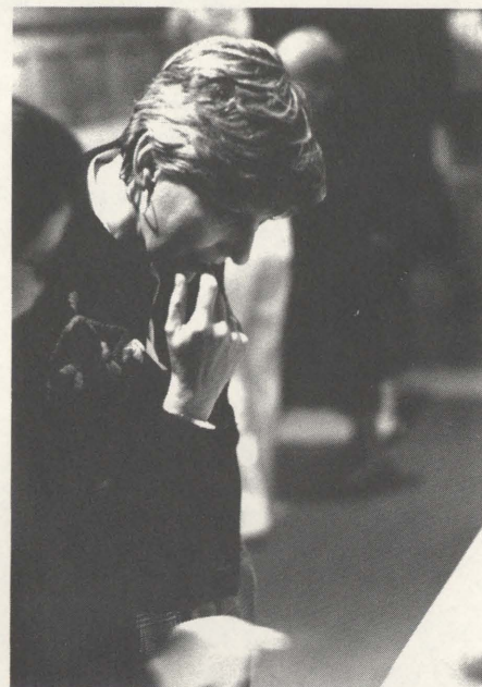
Visitors tour the new exhibition.

The exhibition presents objects of daily life found in the private houses of Early Christian Egypt, Syria, Turkey, Italy, France and North Africa from the 3rd to the 7th century AC. Objects bearing motifs and images associated with the Christian faith are the thematic focus of the exhibition. Endowed by this imagery with spiritual significance, these objects gave special meaning to the day-to-day experience of their owners, and as such they exemplify a very personal side of Early Christian art. According to the excellent catalogue by Henry and Eunice Maguire, the exhibition is meant "to show how that art represents the interpenetration of two kinds of reality: the visible, which obeyed physical laws, and the unseen, . . . which was subject to the operations of beneficent powers and malevolent demons."