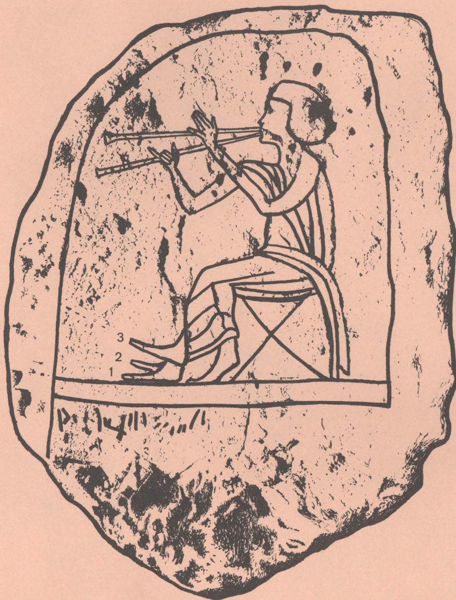
Schematic line drawing of Stele of Pareshy.

The second observation, and one of notable art-historical importance, concerns the positioning of the flautist's feet. In contrast to the ancient artistic prescription of feet flat on the ground, the engraver of this relief subject shows the musician's left foot (closest to the chair's diagonal brace) in a flexed position, with the ball of the foot acting as the weight-bearing fulcrum of the body's precarious balance. The placement and flexion of the left foot might also imply that the musician's torso swayed back and forth from the waist, requiring this foot as a stable pivot to respond to his shifting equilibrium.