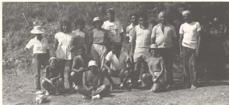
The 1987 Kelsey Museum archaeological research team in Carthage.

The laboratory analysis of the human skeletal remains from the 1987 season has not yet been completed. We can say something, however, about the burial customs on our site. Bodies are placed parallel to the Theodosian Wall, with the heads normally at the west. The heaviest concentration of burials lies within 5 m. of the Theodosian Wall. Within this relatively narrow spit, the burials are often placed one above the other and are arranged, apparently, in parallel lines. In some areas we have found as many as four bodies stacked one above the other. There is quite a wide range of burial types. The largest number consists of simple inhumations. We also have stone cists and mudbrick cists, as well as numerous amphora burials for infants. Some hybrid types are also documented. In one instance the