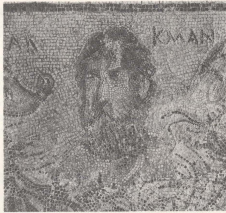
The Greek Lyric Poet Alcman Roman, Mid-2nd Century AC 874.1

The portrait of Alcman was originally one of a series of depictions of literary per-