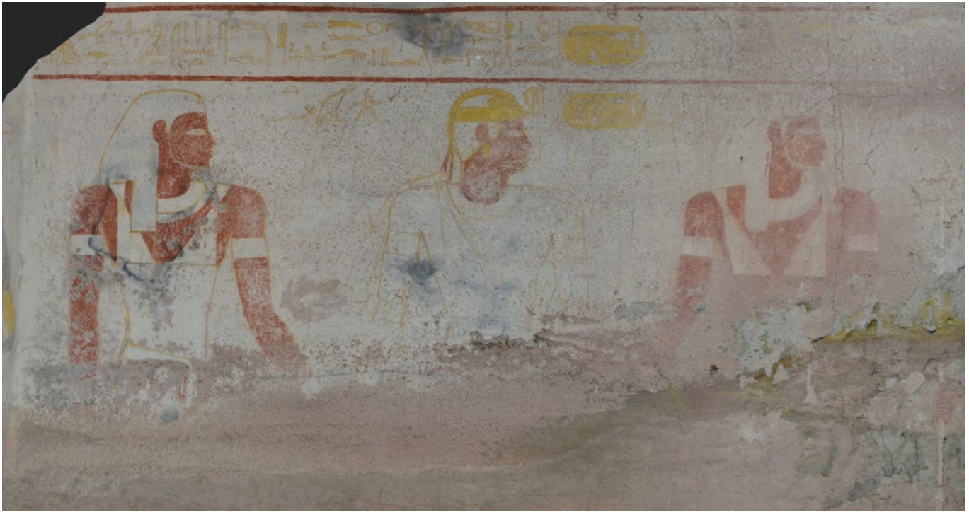
Figure 2. The north wall of the antechamber to King Tanwetamani's tomb in El-Kurru.

past 10 years. El-Kurru was a royal pyramid cemetery for kings and queens of ancient Kush, including kings who conquered and ruled over Egypt as its 25th Dynasty from about 750 to 663 BCE. Our recent work at the site has focused on developing a Community Heritage Center (as described in the Spring 2022 Kelsey Museum Newsletter) that will serve in part to teach local students about the historical importance of the site and reasons for preserving it (FIG. 1).