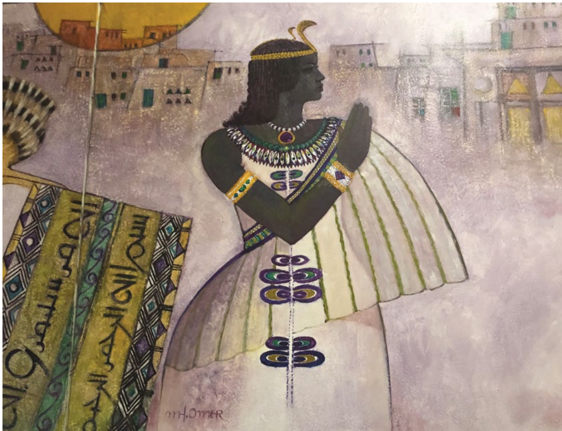
Figure 5. This mural of a Nubian Queen is painted on the Sudanese Embassy in Washington, DC.