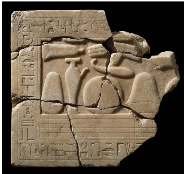
Figure 3. Offering table from the tomb of Queen Khensa in El-Kurru, 690–664 BCE. A 3-D model of this artifact, created by Heidi Hilliker, will be displayed in the exhibit this fall.

In the exhibit, two short films will provide context for the archaeological site: a TED-Ed animated film (written by Geoff Emberling) presents the ancient historical setting, and a flyover film of the village and site contextualizes the latter in its landscape. A highlight of the archaeological presentation will be an evocation of the painted tomb of King Tanwetamani (FIG. 2), who reigned around 664–650 BCE. There will also be a chance to pour an offering—of water rather than the more traditional beer or wine—to Queen Khensa, whose broken offering table (FIG. 3) was found in the