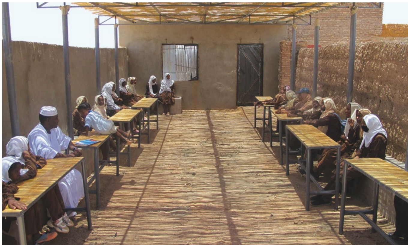
Figure 1. Students in the Community Heritage Center classroom at El-Kurru, Sudan. Photo by Anwar Mahjoub, 2023.

The exhibit begins with ancient Nubia—or Kush, as it was then known—by presenting some of the Kelsey archaeological team’s work at El-Kurru, northern Sudan, over the