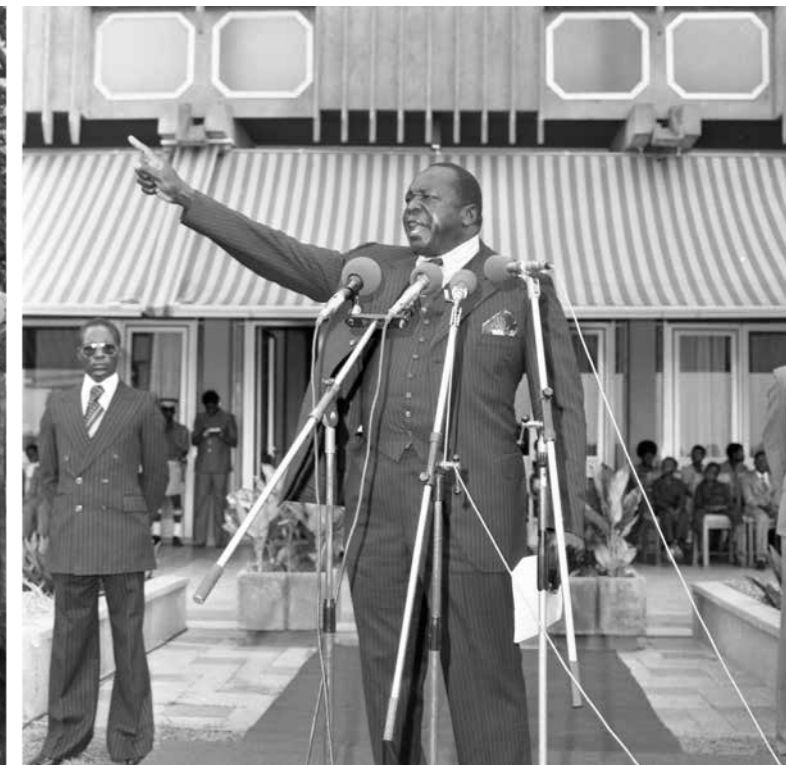
H.E. celebrates 50th birthday at Nile Mansion 1 January 1978