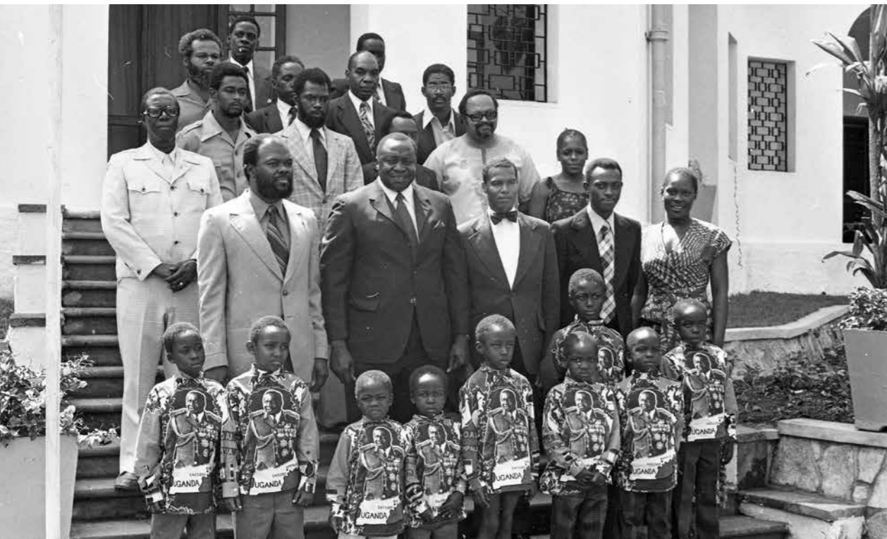
'Black Americans meet H.E.' 11 August 1975 UBC 4867-011