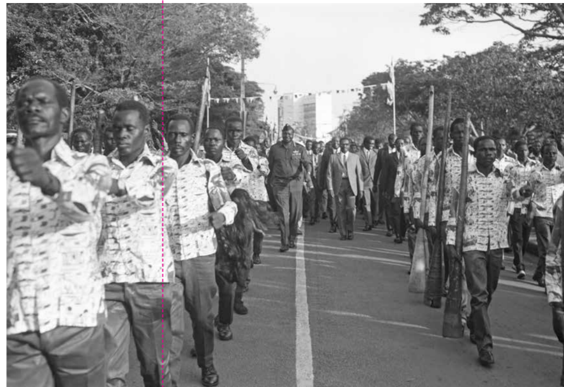
President Amin christens Queens Road as 'Lumumba Avenue' 18 January 1973 UBC 3456-017