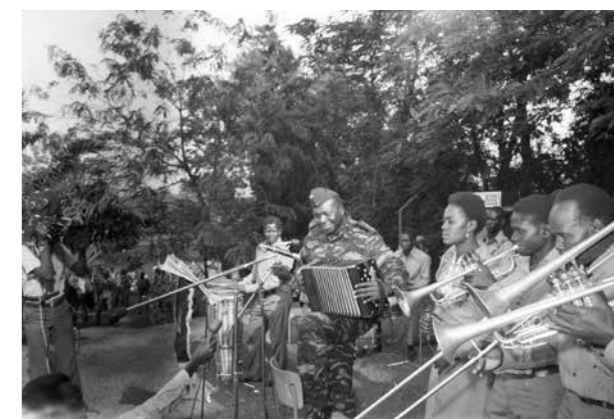
H.E. inspects guard of honour mounted by Marines Unit to mark OAU Liberation Day at command post Kololo 25 May 1974 UBC 3987-002