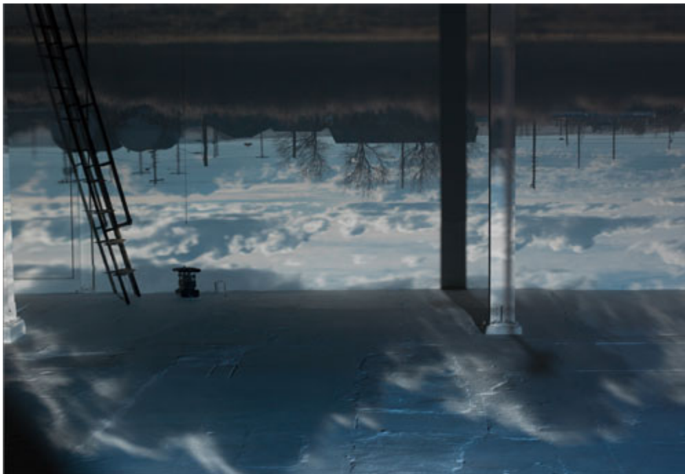
"100 North Nevill Street" by Zoe Leonard