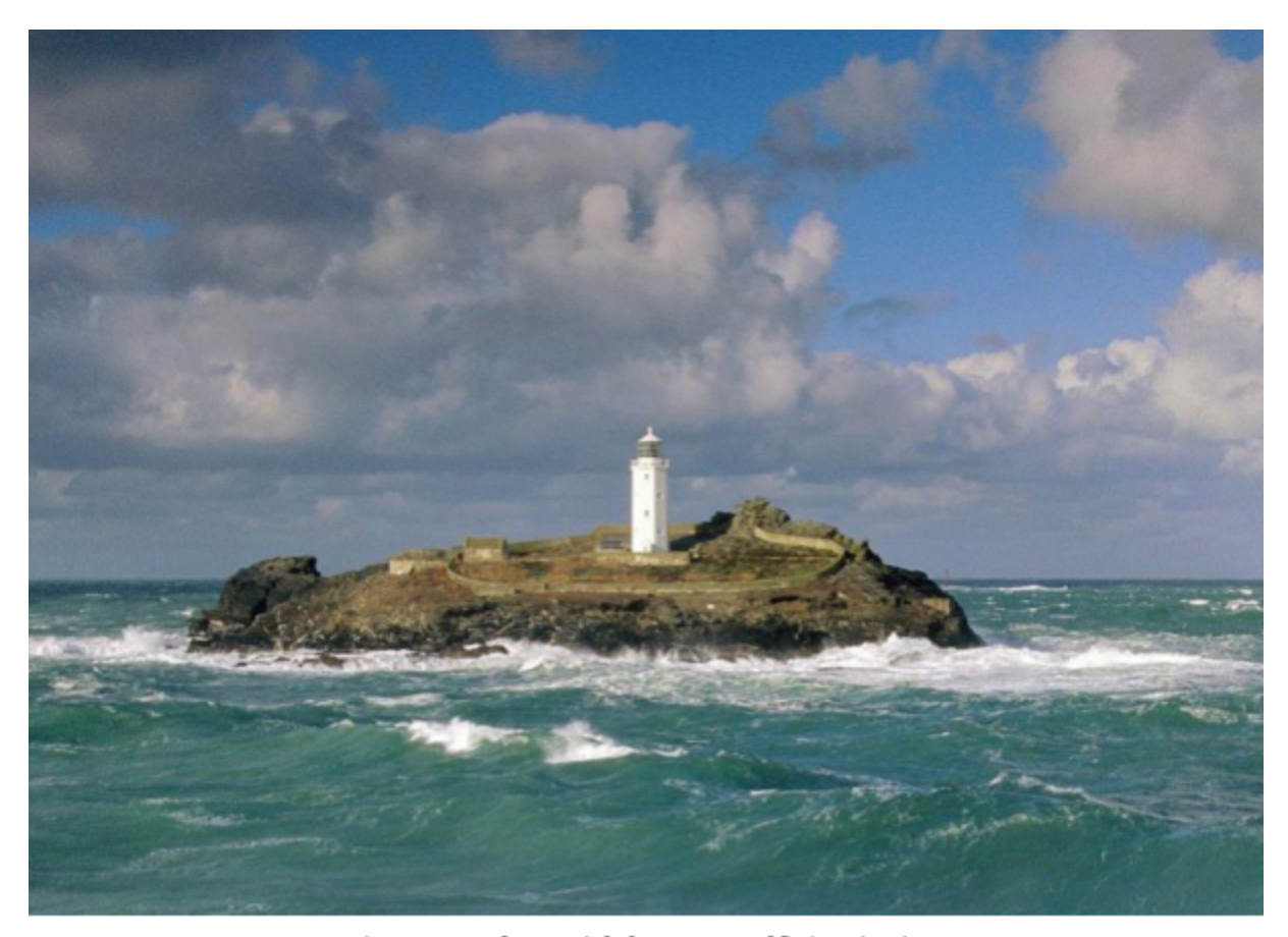
Figure 2: Godrevy Lighthouse, Woolf's inspiration

anything more specific than "some feeling." Symbolism dissipates; the lighthouse becomes, as Woolf herself described it, simply "a line down the middle to hold the design [of the novel] together." It need not be more.