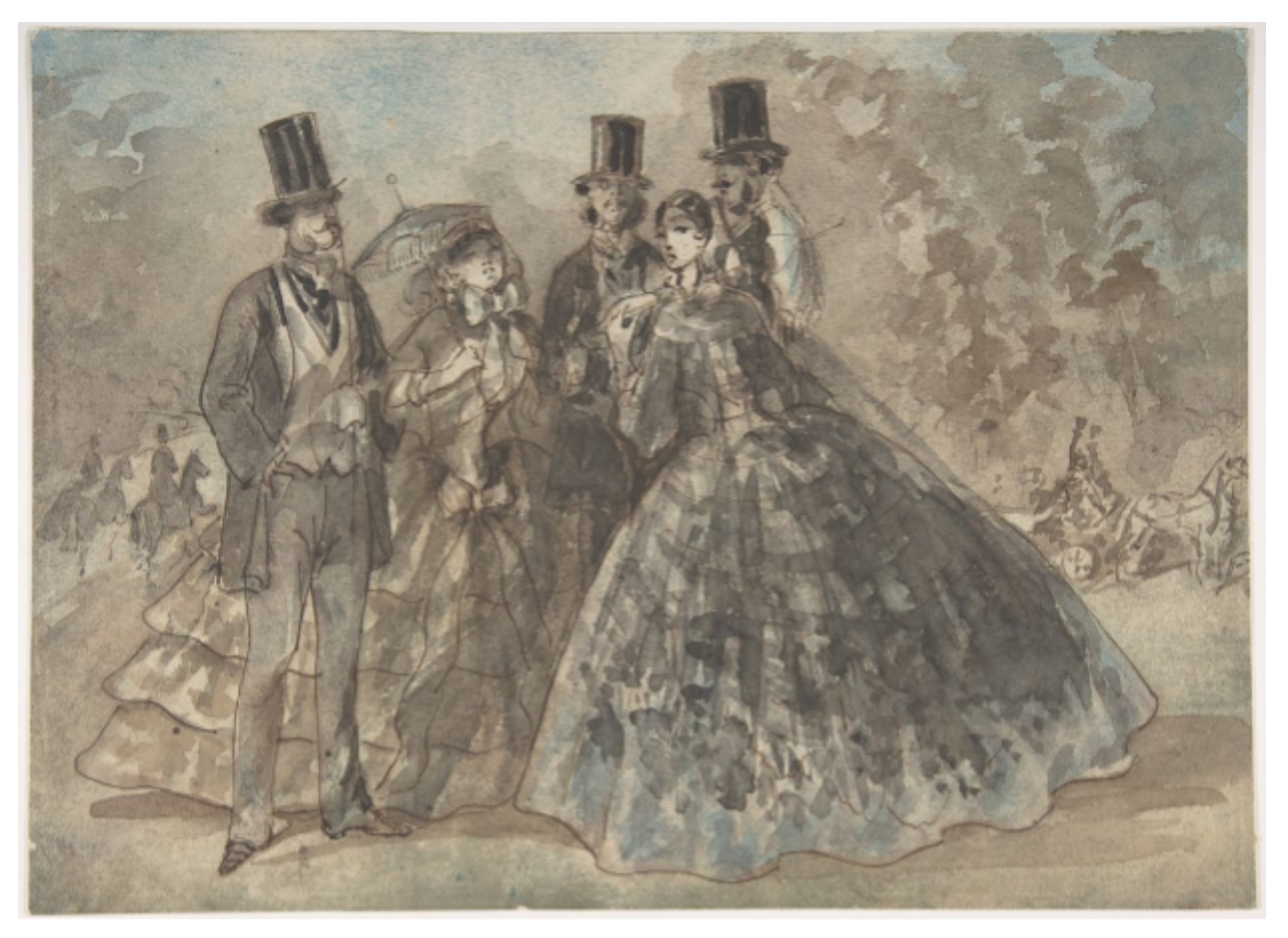
Figure 1: "Meeting in the Park"

immutable" (Baudelaire, 13). Other artists had mastered "the eternal and the immutable" forms of classicism, but Guys found a wealth of unexamined material right before his eyes in the immediacy of Parisian life.