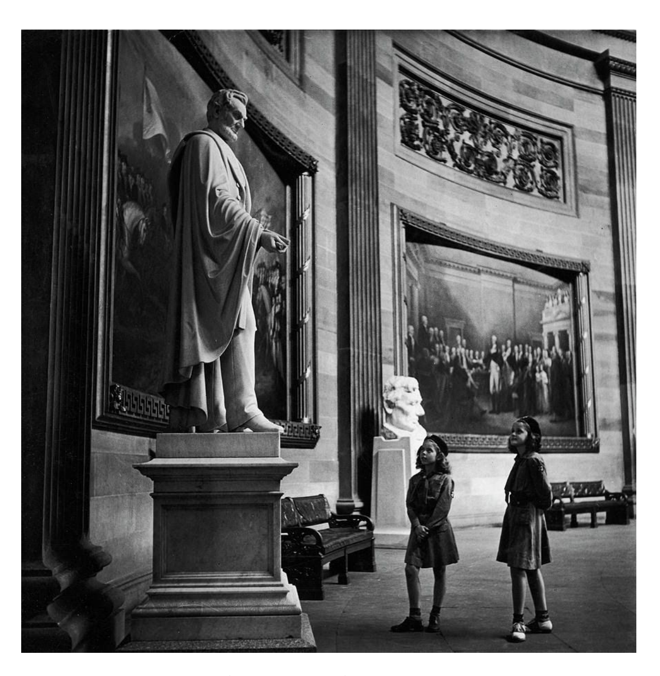
"Two Girl Scouts Looking Up at Marble"