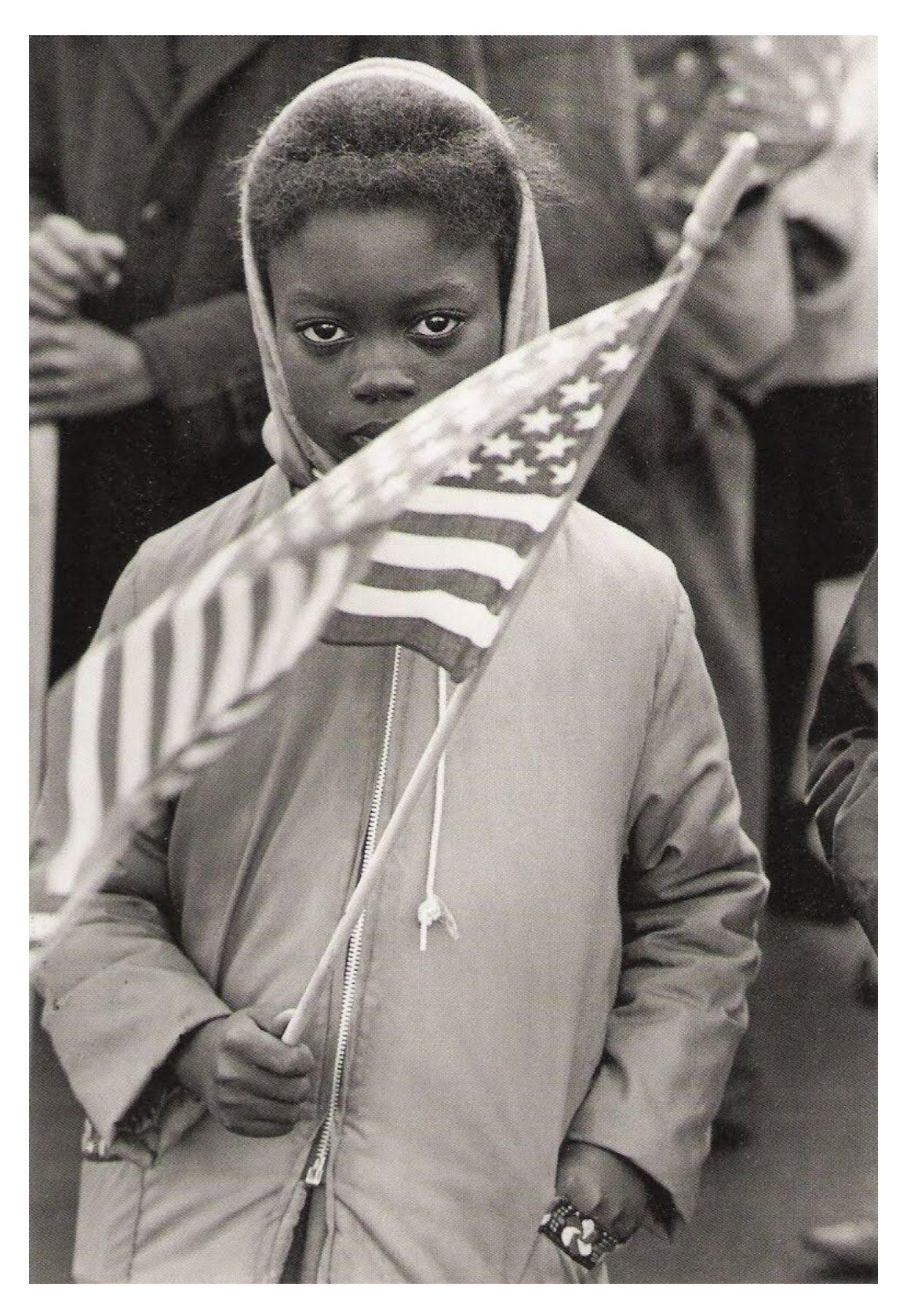
"Black child at Civil Rights protest march, North Carolina, 1961"