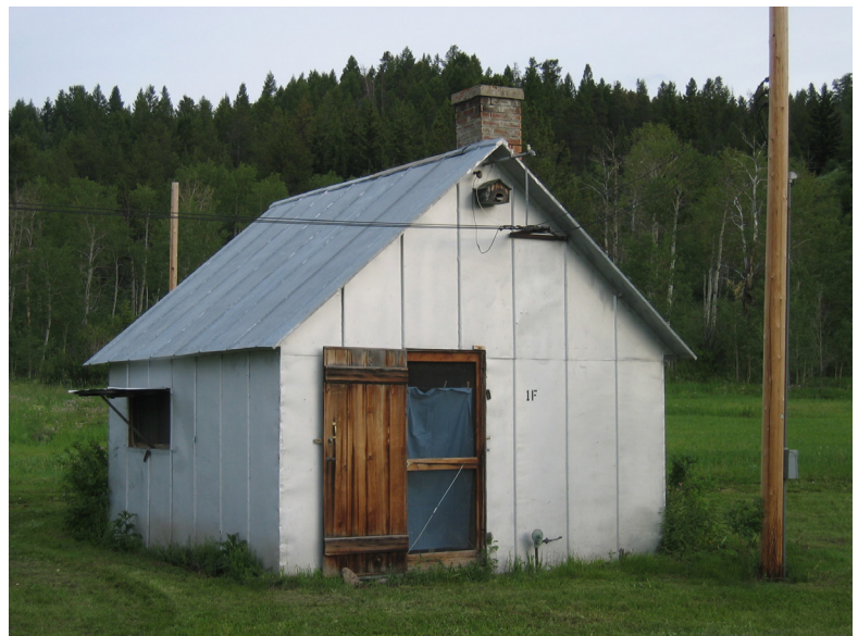
Figure 3. Cabin 1F, a representative student residence cabin at Camp Davis with sheet-metal siding and roof, open-flap window and rough door. Electricity is strung from cabin to cabin on overhead wires via knob and tube connections. Chimney was for coal stove heat, which has been removed. Cabins are on ground-level slabs that are broken by frost heave and which are susceptible to animal entry.