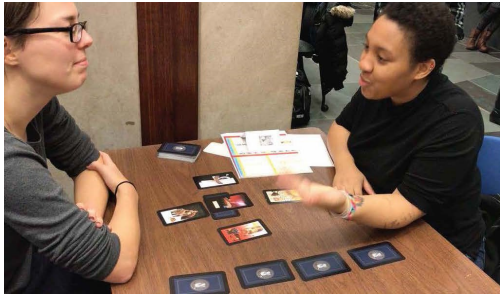
Graduate student teaching experience