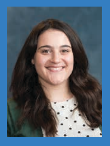
bad Russian spoken in American movies, knitting, and hanging out with her three pet tortoises.