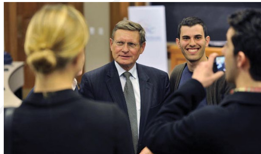
Leszek Balcerowicz (center)

October 26, 2011. Leszek Balcerowicz , former Polish Finance Minister, lectured on the current financial crisis in Europe and the future of the European economy. Balcerowicz is best known for engineering the “shock therapy” approach that moved Poland to a market economy. Poland now has one of the healthiest economies in the European Union, and is the only EU country that maintained positive GDP growth through the 2008-09 global economic crisis.