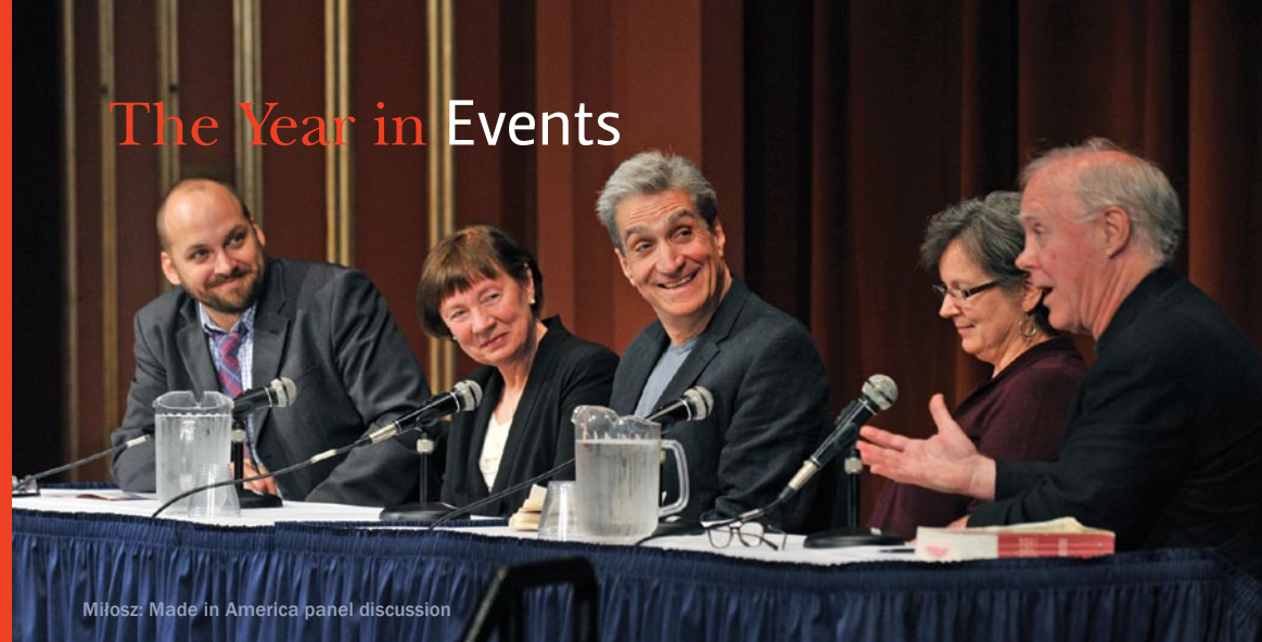
Miłosz: Made in America panel discussion

Each of the programs listed below may be viewed at youtube.com/user/umcrees in the Copernicus Endowment Lectures playlist.