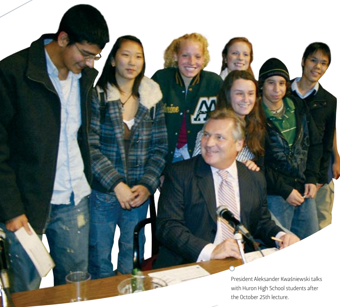
President Aleksander Kwaśniewski talks with Huron High School students after the October 25th lecture.

The scene on October 25, 2006 helped define an event that was less a formal lecture by one of the key geopolitical players in recent East Central European history than it was a wide-ranging talk that focused on Poland’s place in NATO and the European Union, two