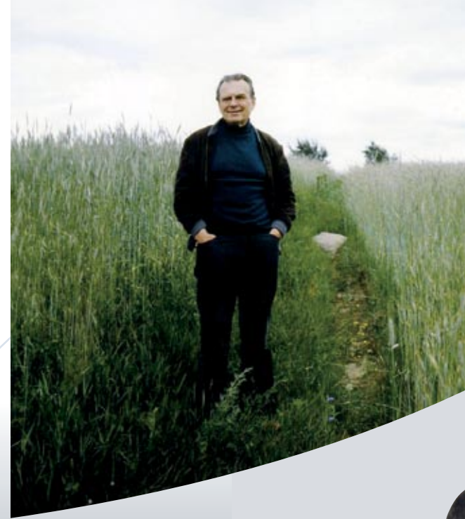
Left: Poet Czesław Miłosz