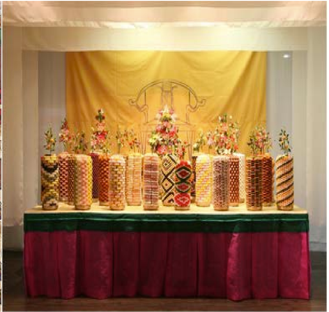
(좌) 정해진찬도병(丁亥進饌圖屏) 중 만경전내진찬도(萬慶殿內進饌圖), 1887년 (우) 만경전 내진찬의 대왕대비전 진어찬안(大王大妃殿 進御饌案) 재현