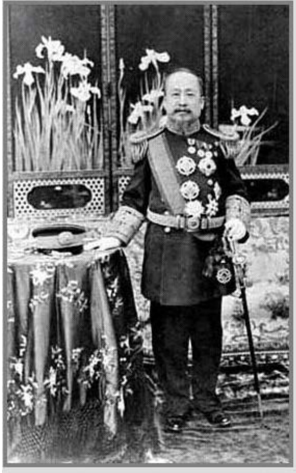
King Gojong (1852-1919)