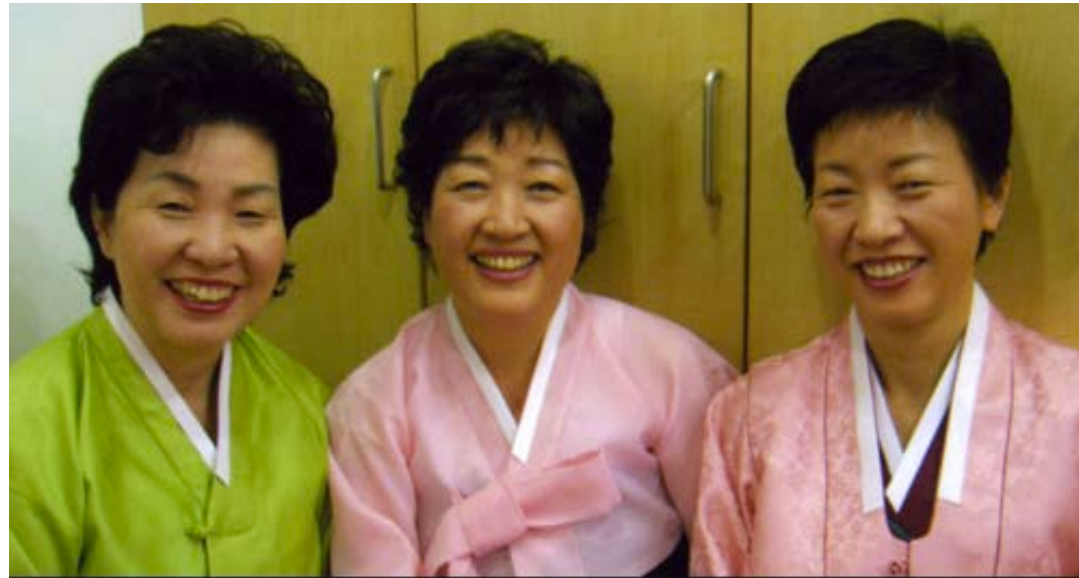
Hwang's three daughters