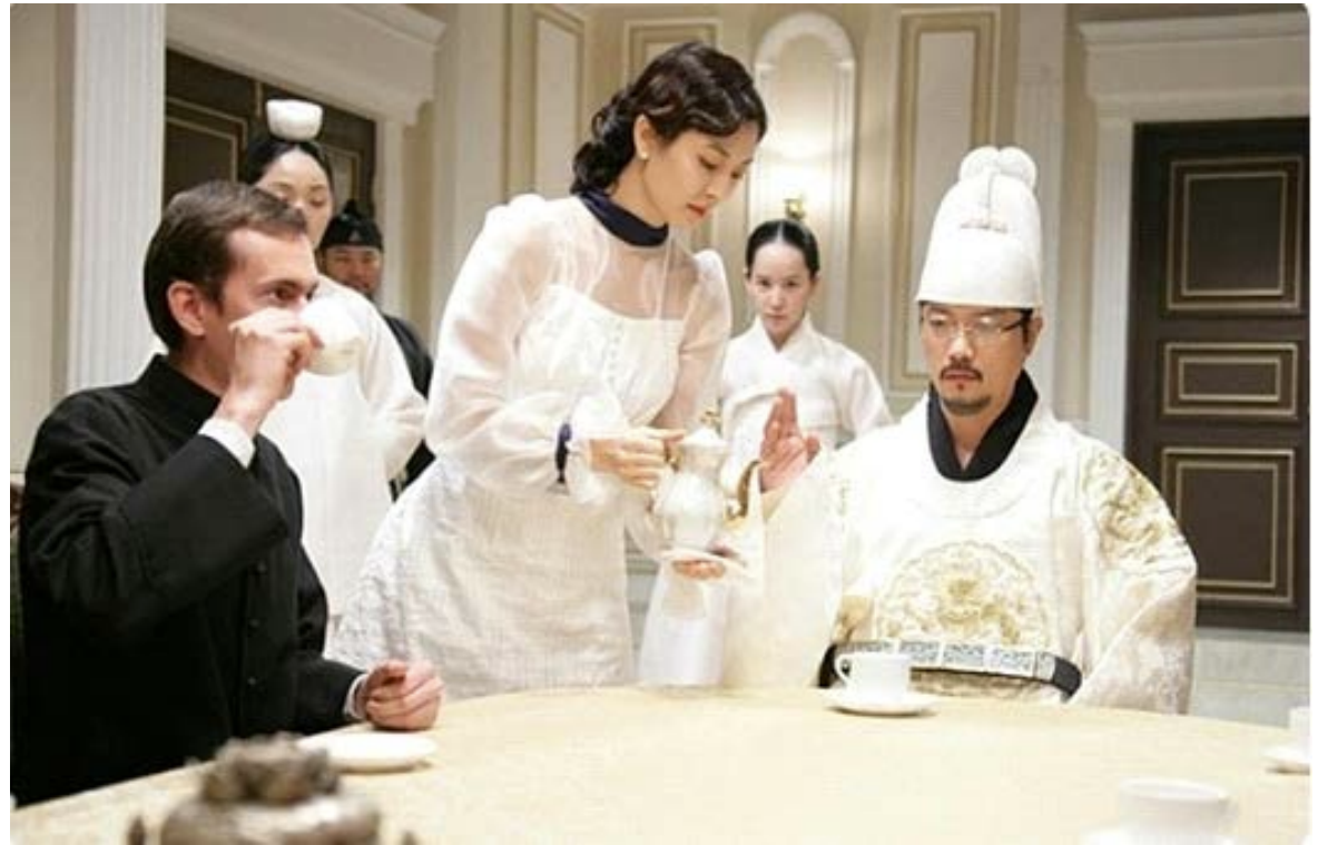
Film: Gabi (2012)