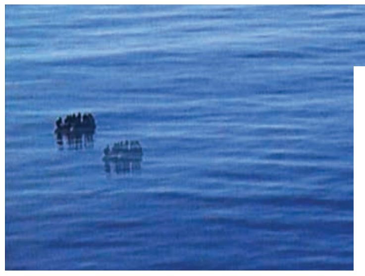
Top image: Still from film Havarie ( Collision ). Bottom image: Group shot

Places where devastation is still visible alongside new opportunities. Cities that are rough and at the same time interesting and beautiful. In 2016, artists from both cities-poets, emcees, singer/songwriters, beat producers-came together in Detroit and created an entire album in just one week of rich collaboration. In September, the department hosted many of those artists in Ann Arbor for a screening of Philip Halver's inspiring documentary about the process alongside live artist performances. We also welcomed a delegation of social workers from Berlin to the event for an evening that was an inspiring, crosscultural and multi-media. For more information visit